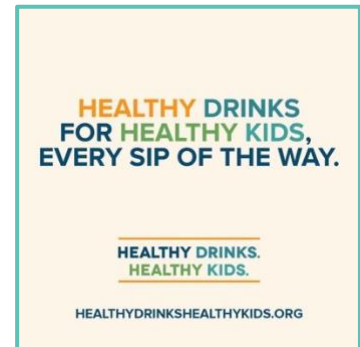
Social Media Graphics